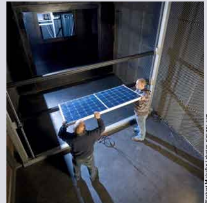
▲ A big black box: PHOTON Lab's solar simulator is installed in a dark chamber.

Of course, PHOTON Lab didn't buy this equipment just to take yield measurements. The lab can now conduct a variety of independent tests and, therefore, can be contracted for various tasks – for example, to examine a PV system on behalf of an operator or to test modules for installers.